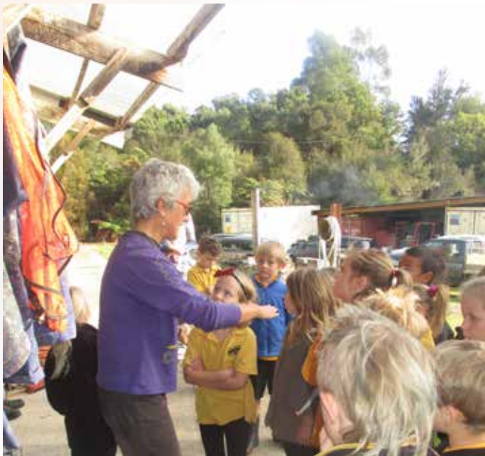
Together we ride the wave of life long success | Creative, Collaborative, Connected, Confident