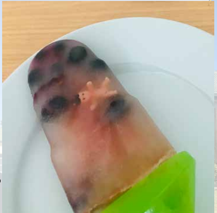
"Ice Ice Baby"