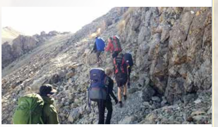
Together we ride the wave of life long success | Creative, Collaborative, Connected, Confident