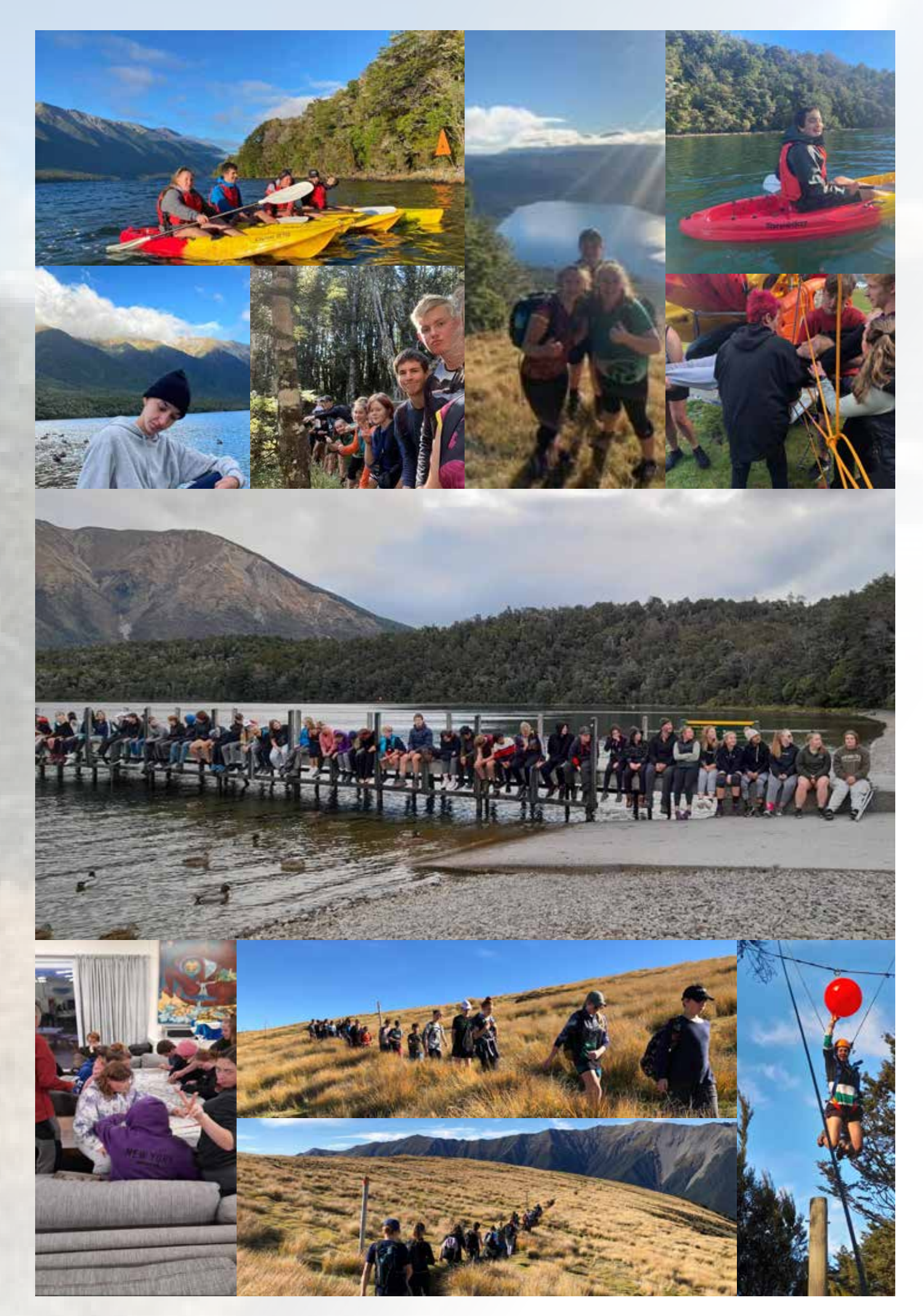
Together we ride the wave of life long success | Creative, Collaborative, Connected, Confident