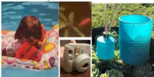
Favourite Maia pics