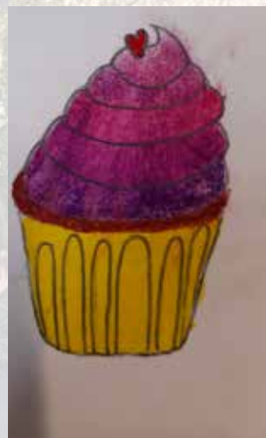
Zack - Year Eight - Cupcake pastel