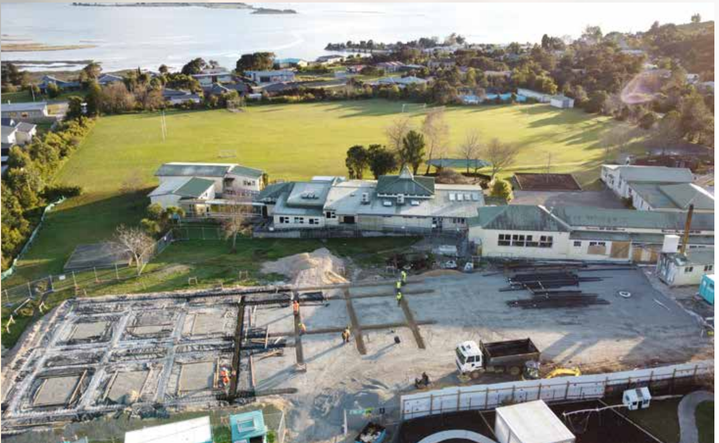
New School Block