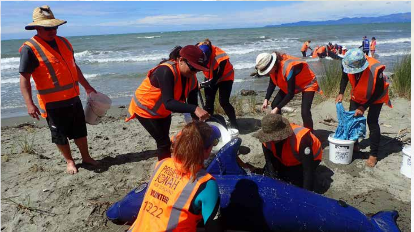
In Golden Bay