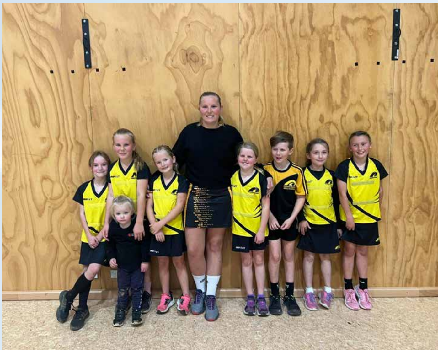
The CAS Bumblebees