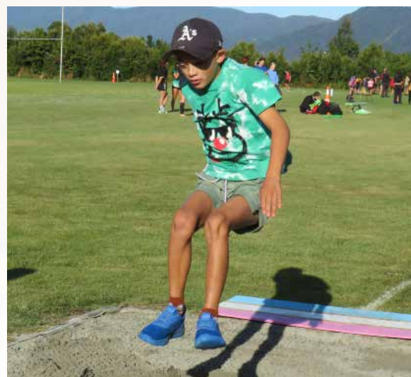
Austin - Long Jump